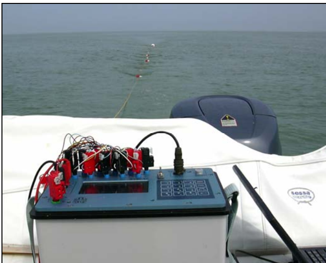
Graphite electrodes floating cable connected to SYSCAL Pro 10 channels

The standard spacing between takeout is 4 meters ; cable with other spacing can be supplied to match your requirements.