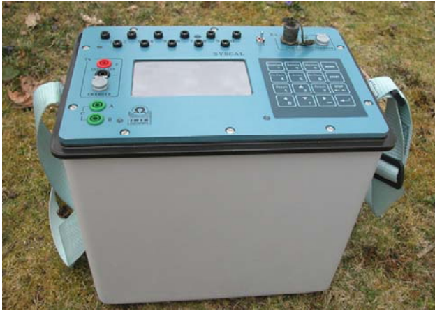
SYSCAL Pro unit