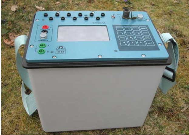
SYSCAL Pro unit